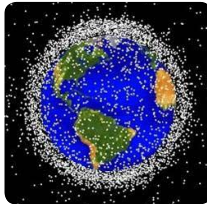
Current space junk monitored by Star Vision

As dump-sites go, there's nothing quite like Earth's orbit: Totally gone or near-dead spacecraft, spent motor casings and rocket stages, all the way down to pieces of solid propellant, insulation, and paint flakes! Toss in for good measure thousands of frozen bits of still-radioactive nuclear reactor coolant dribbling from a number of aged Russian radar satellites!